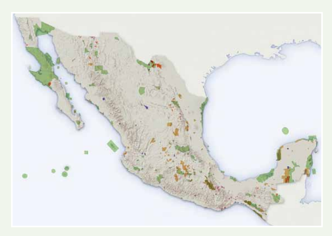
Figure 2: Mexico's protected areas

This assessment also explored alternative funding sources for protected areas. A public infrastructure development compensation tax - paying for the diffuse negative environmental impacts of construction - could generate $307 million in funding for PAs. A carbon emissions tax for in country air travel could raise US$6.7 million a year, without a negative impact on flight costs. Redirecting 0.1% of existing public rural and fisheries budgets towards environmentally friendlier production could generate over US$34 million yearly.