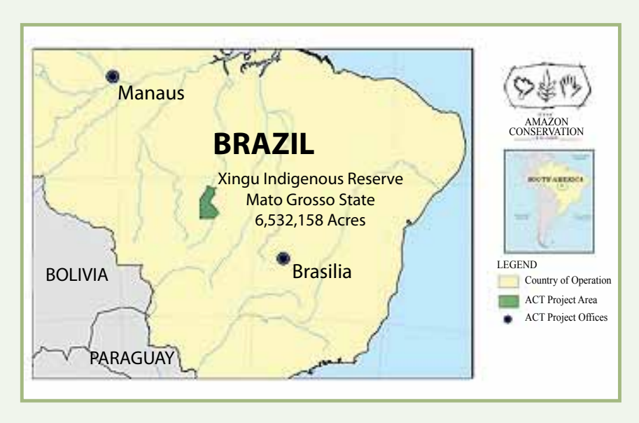
Figure 1: Location of the Xingu Indigenous Park

The important sizes of the reserve, the lack of federal resources as well as pressures caused by human activities and urbanization processes taking place in the headwater area (outside the reserve), have had important environmental and social repercussions on indigenous people residing in the PIX<sup>25</sup>. In 1999, in an attempt to overcome those challenges, the Park's Indigenous communities sought the help of The Amazon Conservation Team (a non-governmental organization working in partnership with indigenous people of Latin America to conserve biodiversity in greater Amazonia), to identify and map their cultural and territorial knowledge and their specific needs. The mapping effort was subsequently used to help indigenous organizations of the Xingu Indigenous Park to be put in charge of the management of their own land and cultural conservation efforts<sup>26</sup>.